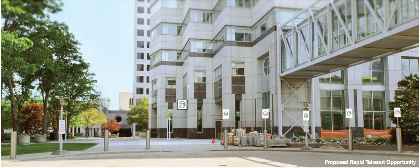
Proposed Rapid Takeout Opportunity