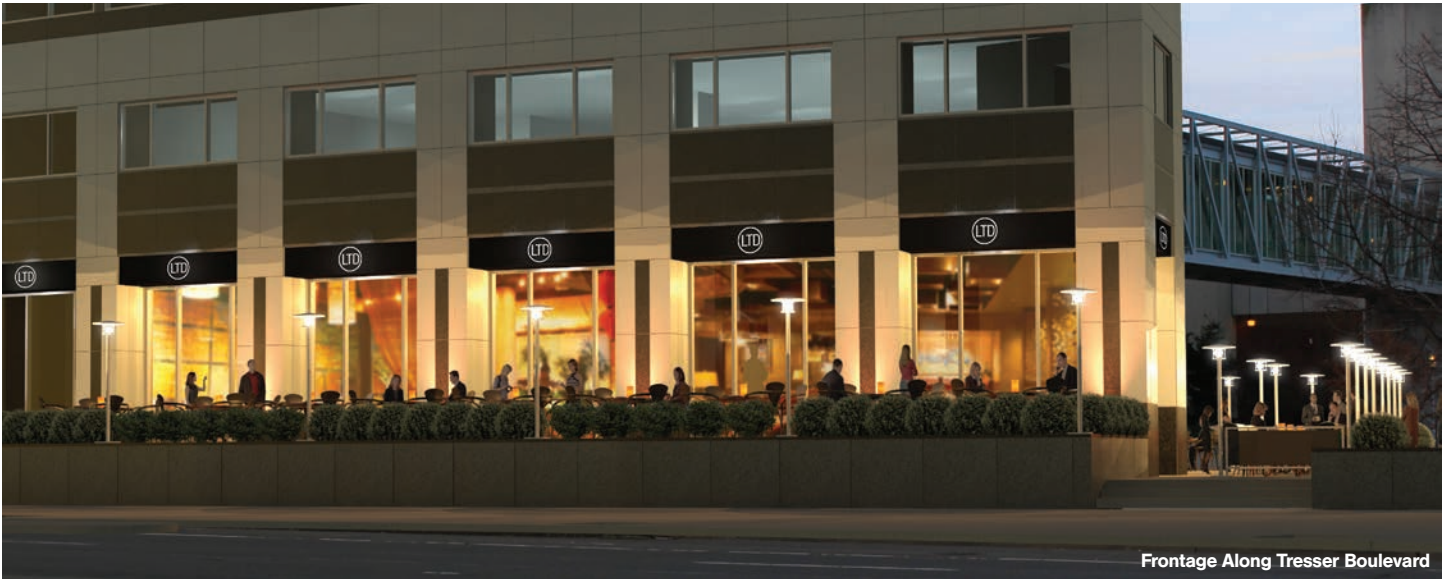
Frontage Along Tresser Boulevard