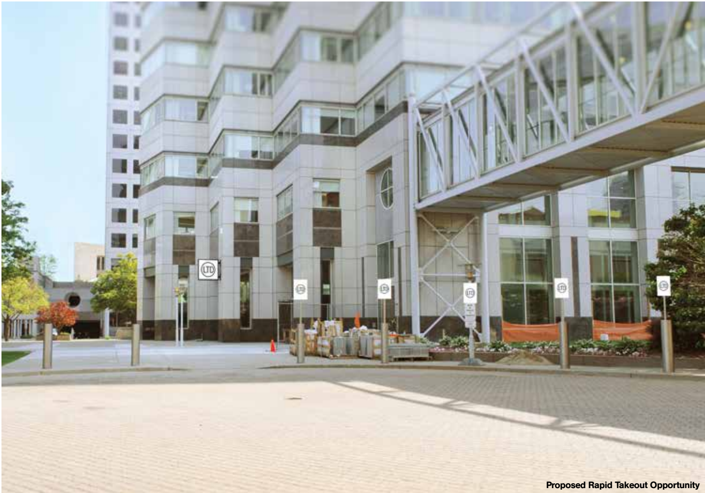
Proposed Rapid Takeout Opportunity