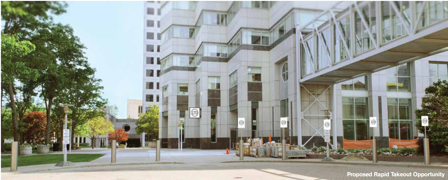
Proposed Rapid Takeout Opportunity