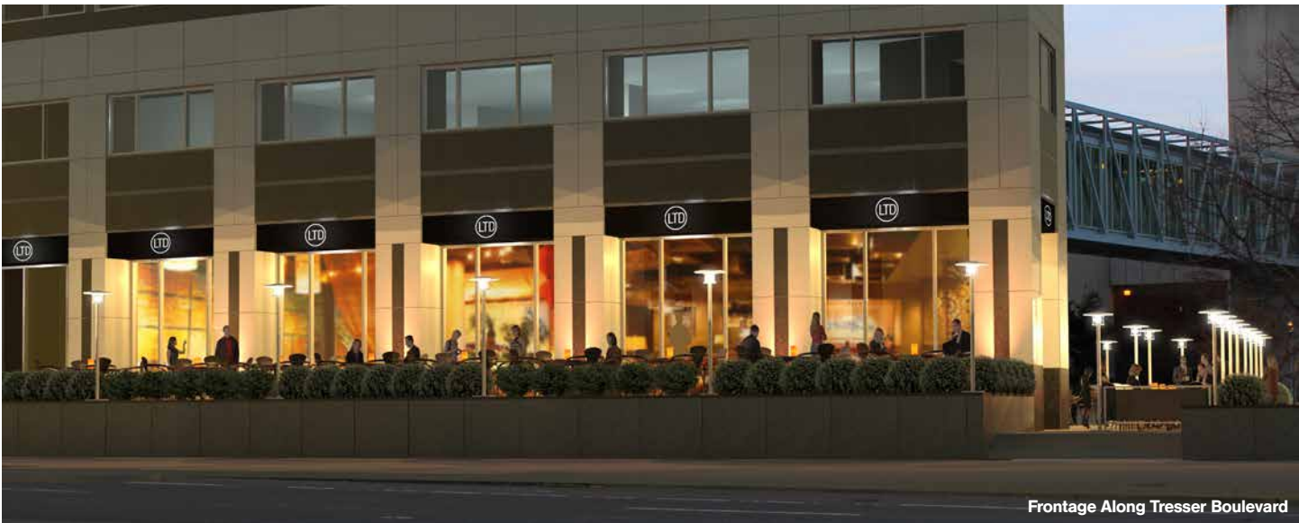
Frontage Along Tresser Boulevard