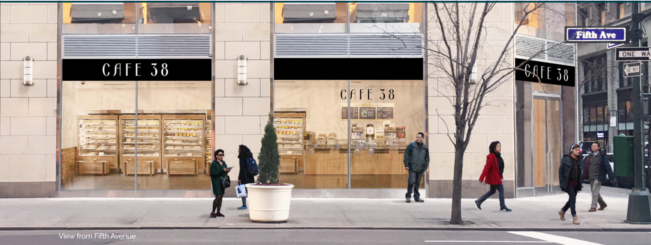
View from Fifth Avenue

Spectacular corner space features 2,138 square feet on the Ground Floor and 9,014 square feet on the Lower Level, in addition to new glass storefront. Situated at the corner of Fifth Avenue and East 38th Street at the base of a 60-story office and residential tower directly across from Lord & Taylor's Flagship