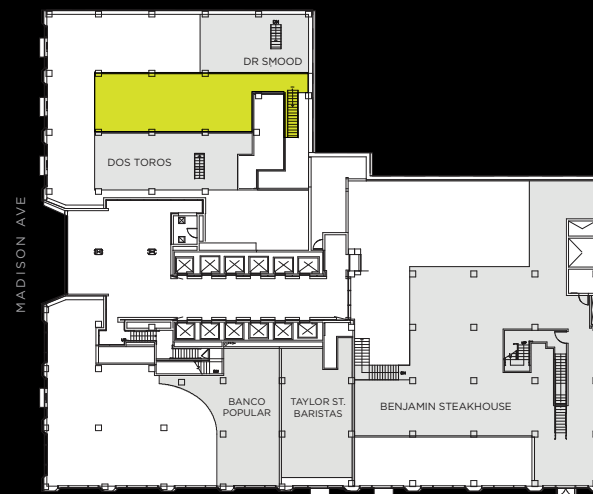
MEZZANINE 1150 SF

IDEAL OPPORTUNITY ON THE NE CORNER OF MADISON AVE & 40TH ST