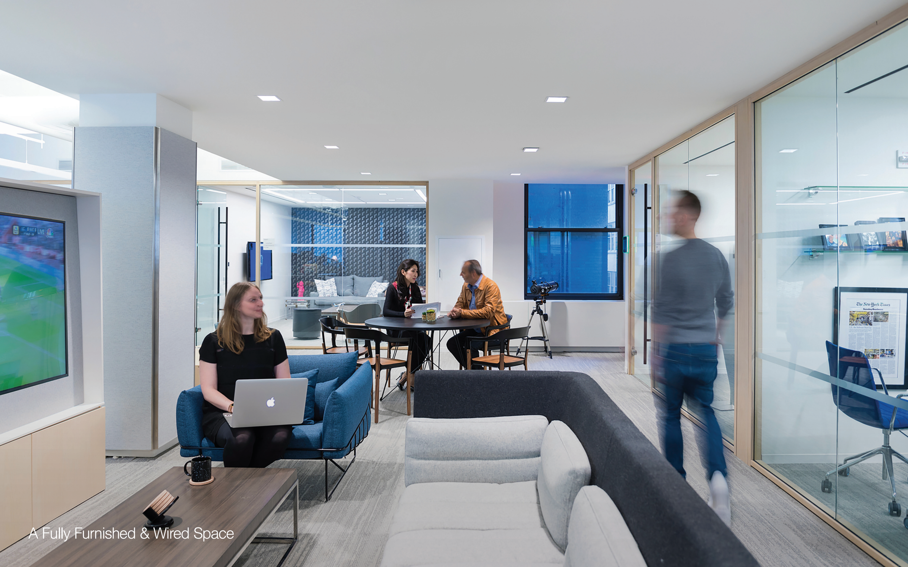
A Fully Furnished & Wired Space