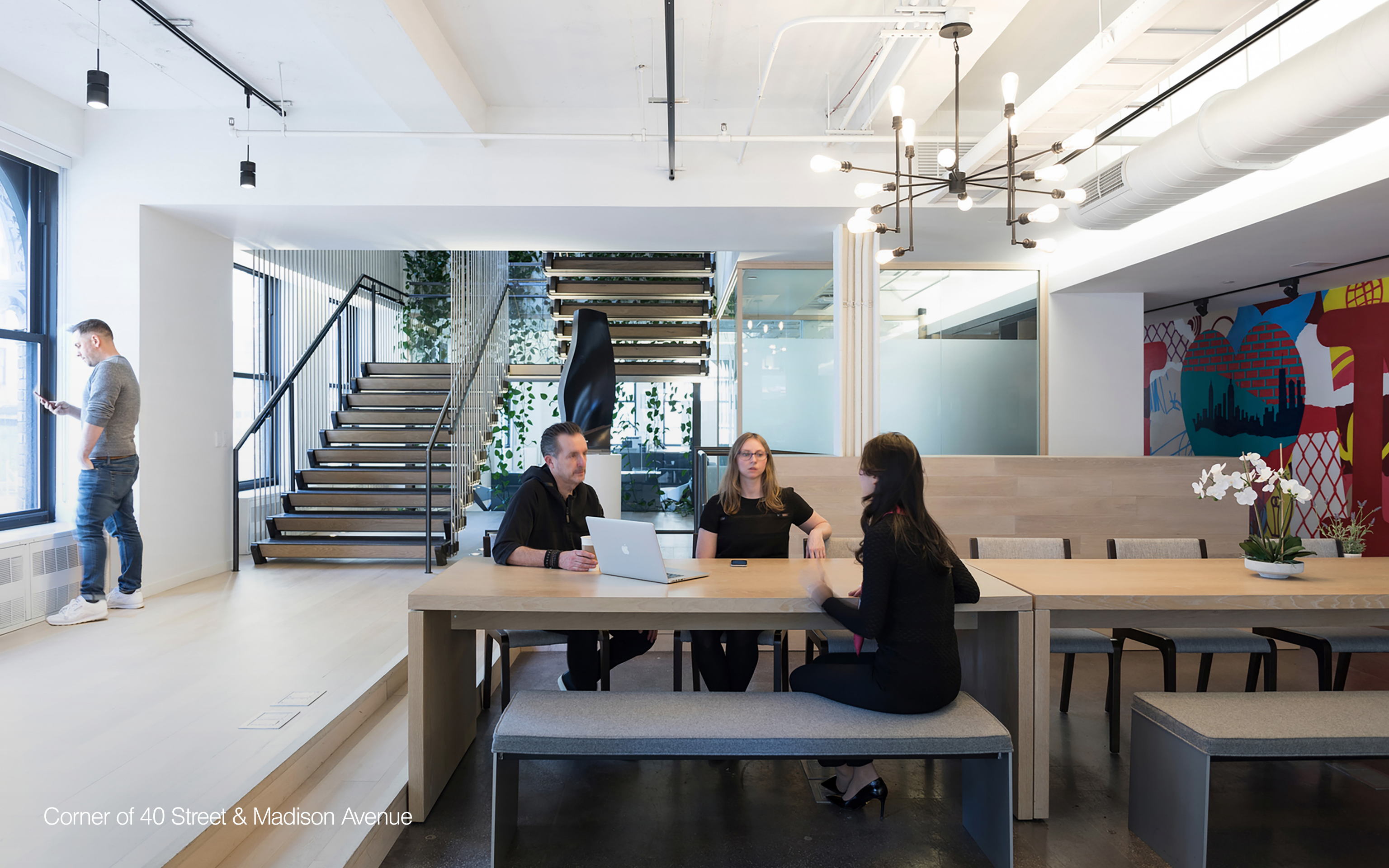
Corner of 40 Street & Madison Avenue