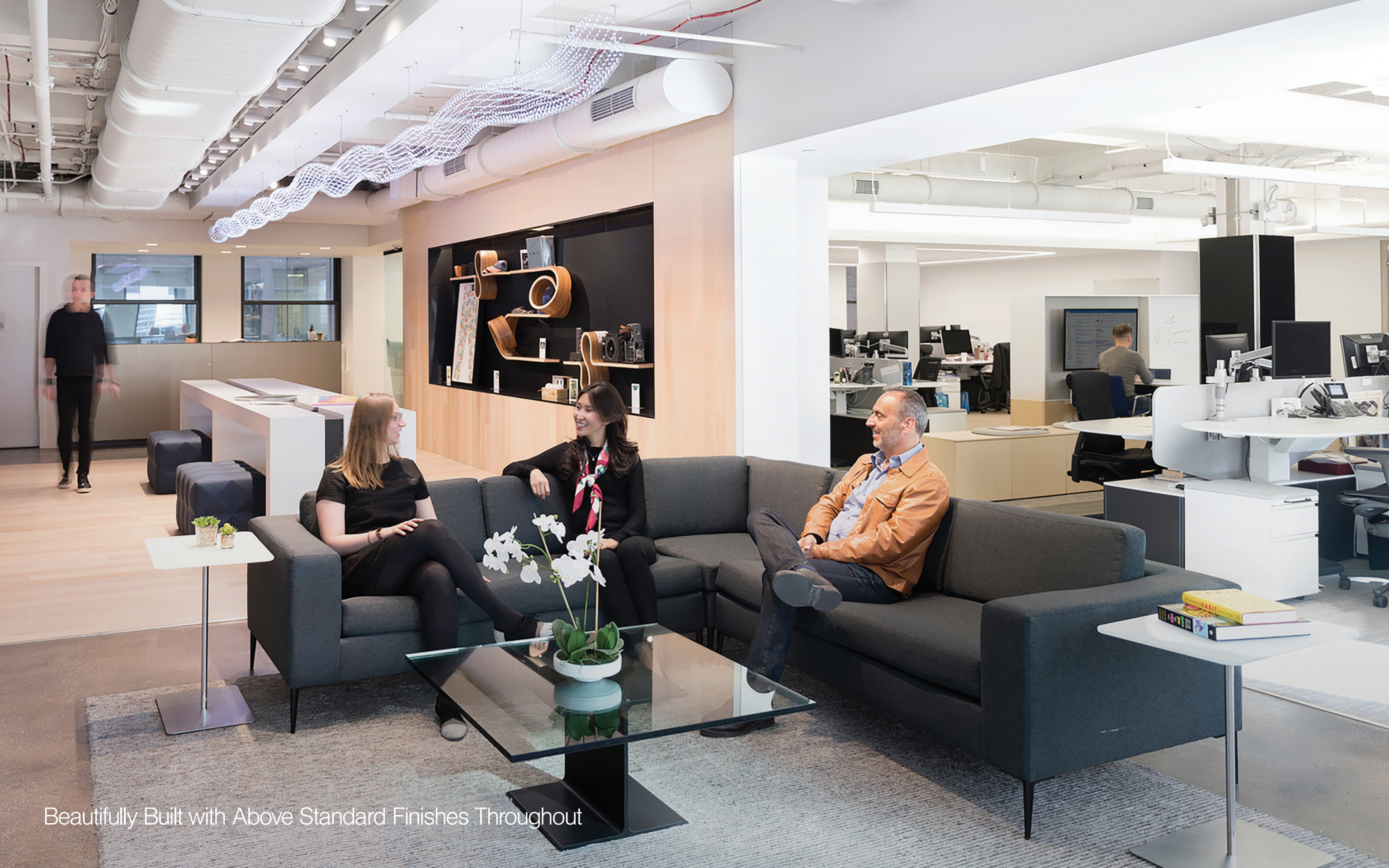
Beautifully Built with Above Standard Finishes Throughout